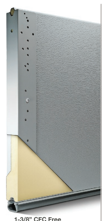
1-3/8" CFC Free Urethane with steel back • R-values: 12.35